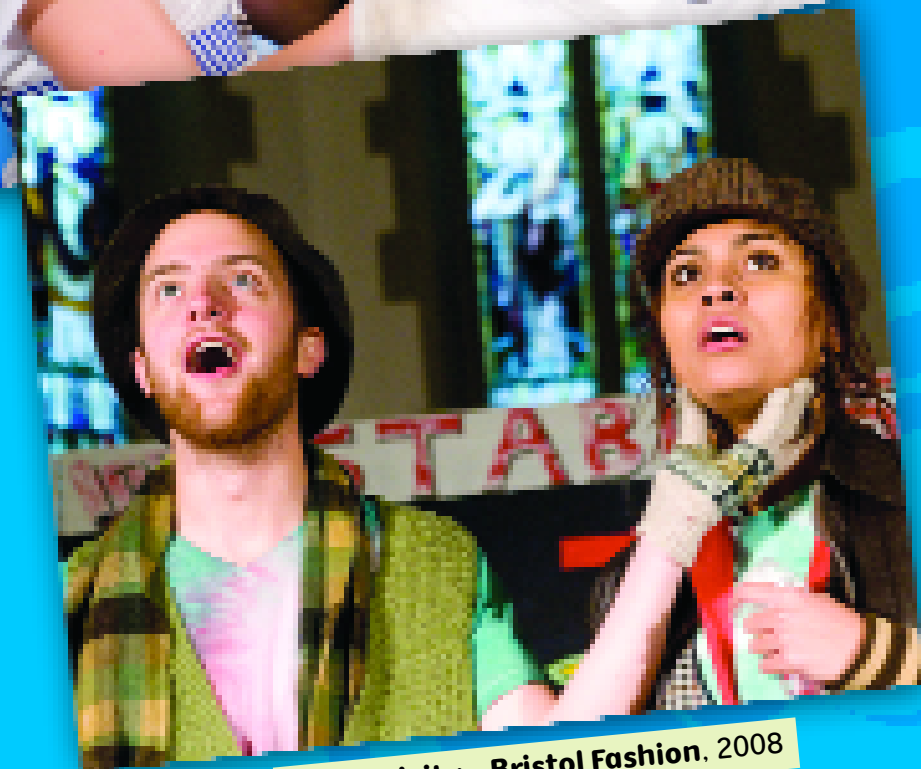
The Nativity - Bristol Fashion. 2008