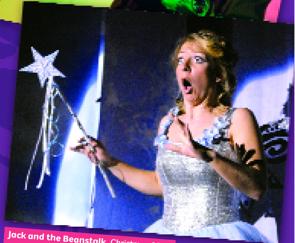
Jack and the Beanstalk, Christmas 2007